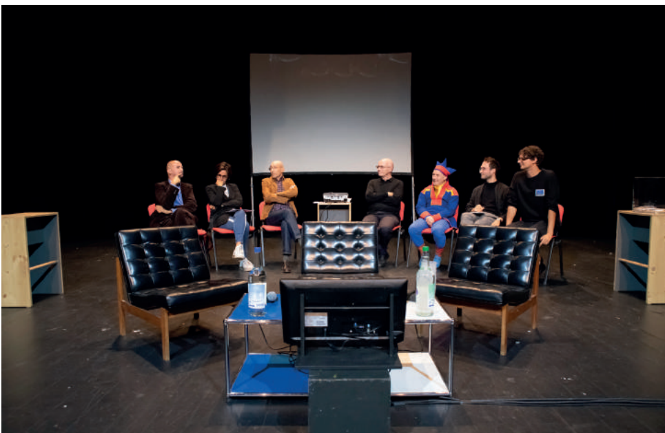
Discussion Philosophy and engagement