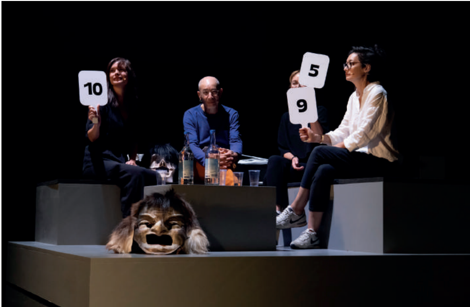
The jury, different every night