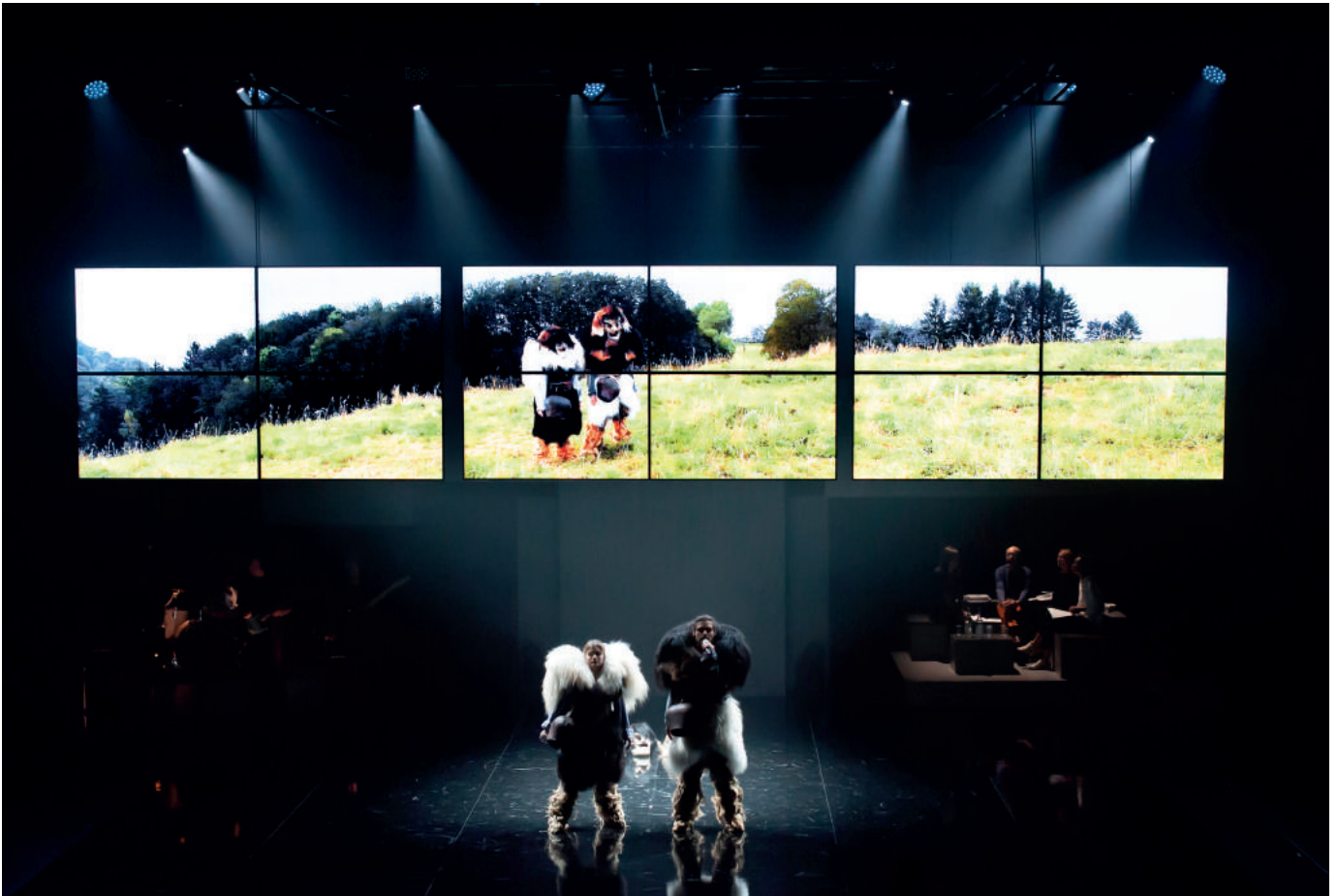
© Laure Ceillier & Pierre Nydegger