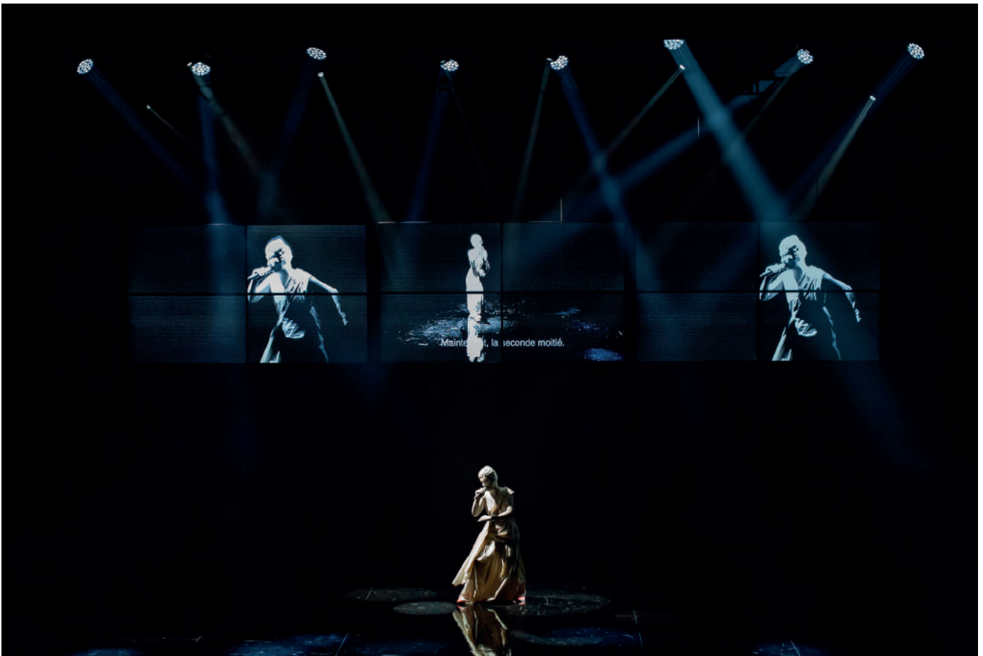
© Laure Ceillier & Pierre Nydegger