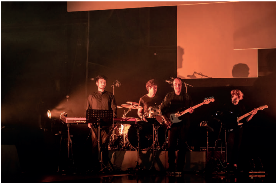
The Europhilo Orchestra